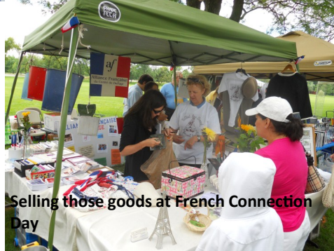
Selling those goods at French Connection Day

Our 2011-2012 calendar is already dotted with very exciting programming which is sure to please everyone. Our popular café-conversations will continue. We are happy to report that we will return to the Arcadium Coffeehouse in St. Charles for some Fox Valley conversation groups, while trying out a new chocolate store in Geneva too. We're experimenting a new Downers Grove location for Monday evening conversation groups. Our calendar also includes various cultural and culinary programming - Stay tuned to our website for more details.