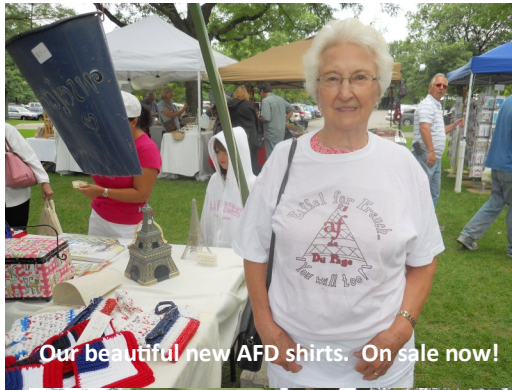
Our beautiful new AFD shirts. On sale now!

The Alliance is doing very well financially thanks to your continued patronage of the organization through your memberships and volunteer service. In August, we had a very successful event, French Connection Day at Cantigny Park in Wheaton, where countless visitors to our booth allowed us to bring a very generous pool of money into the Alliance's account. This will allow us to continue in the trail of stability we have blazed, without having to consider increases in membership dues or sign-up fees to events.